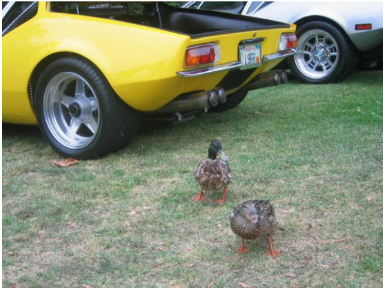
Couple of ducks