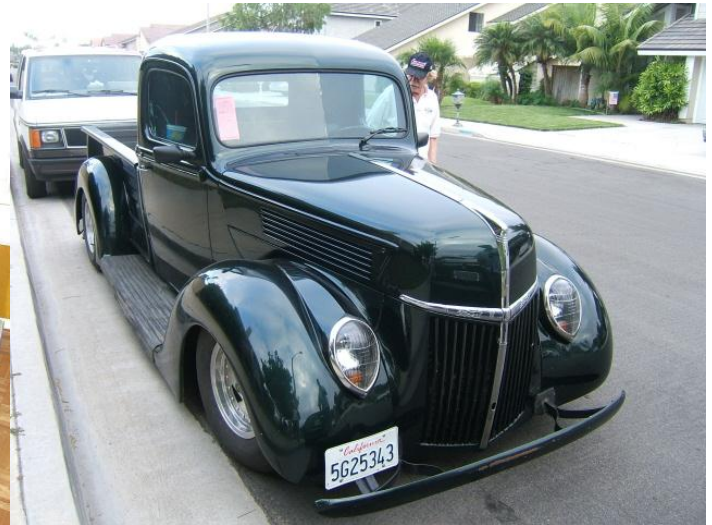
Gary's new Pickup