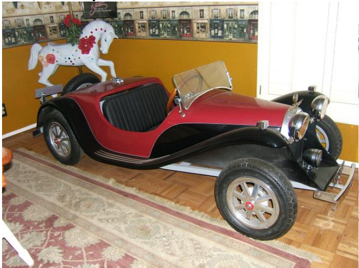
Dave's Little Bugatti