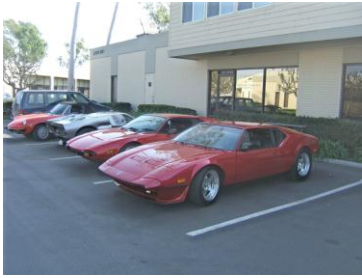
Los Alamitos Wine Run