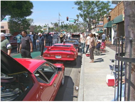
2 rows of Panteras