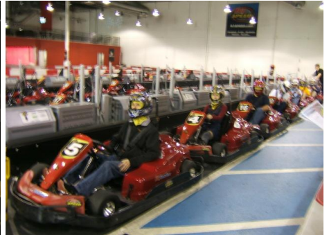
Ready to Go!!!!