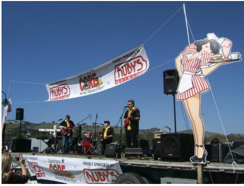
Rock n Roll Band