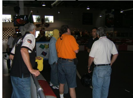
Right pedal is for what?