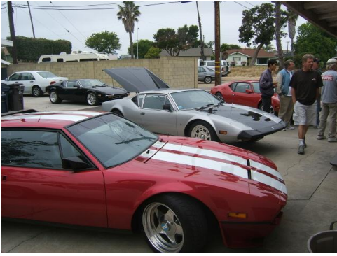
The Gathering in May