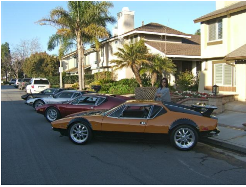
Aida oversees the Cats