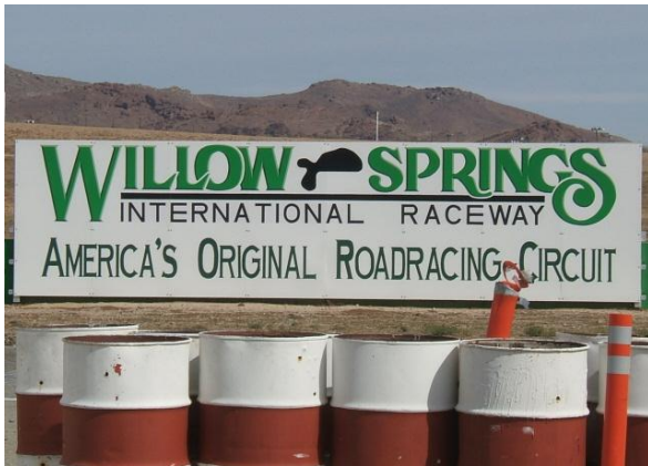
Willow Springs Track