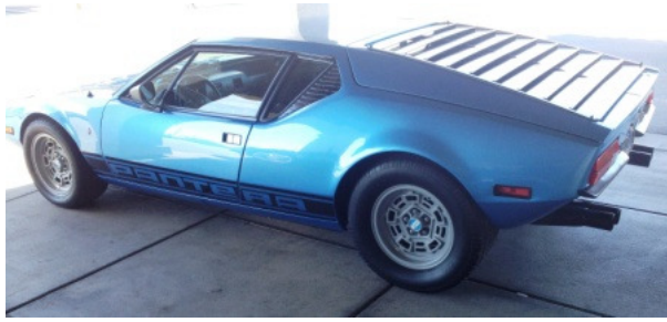
Judy's new paint job