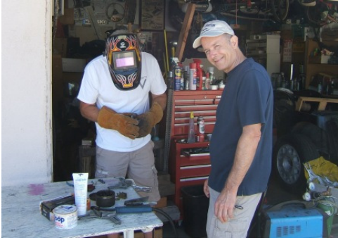
Greg asks, "Who is that masked man?"