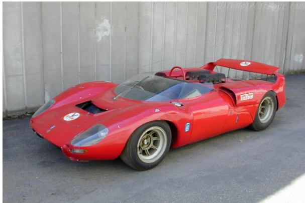
1966 P70/Sport 5000