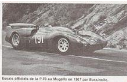
Essais officiels de la P-70 au Mugello en 1967 par Bussinello.