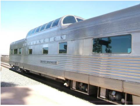
Burlington Silver Splendor