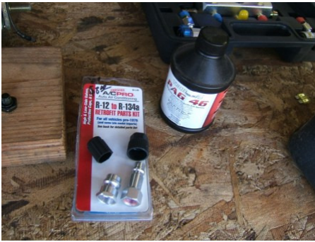
A/C conversion kit