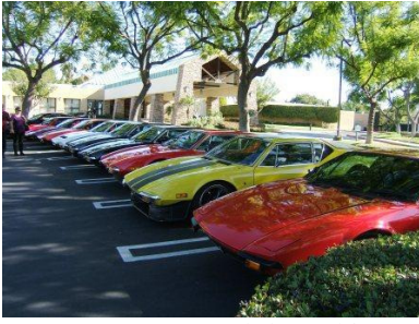
Country Club Parking