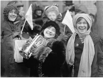
Won the Vote 1920