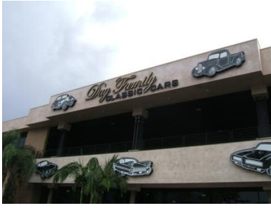
Day Family Museum