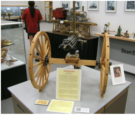
Gatling Gun 1876