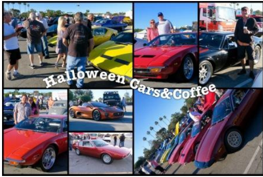
Cars & Coffee