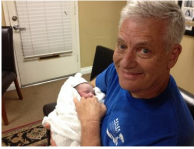
New Pantera Driver