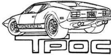
More at www.ocPanteras.com