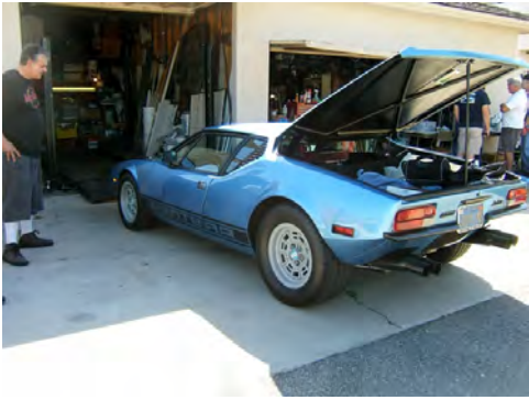
Judy's car prep for Rally