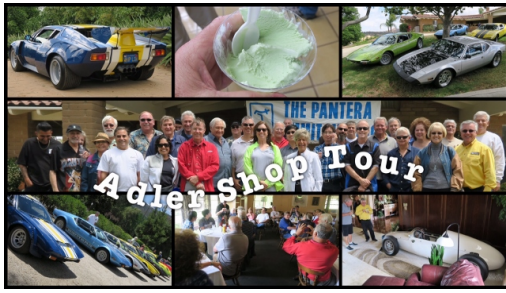
Adlers' Hilltop Ranch