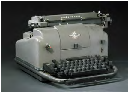
Time to rest