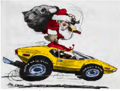
Taken from POCA newsletter