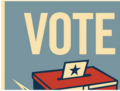
At the General Meeting