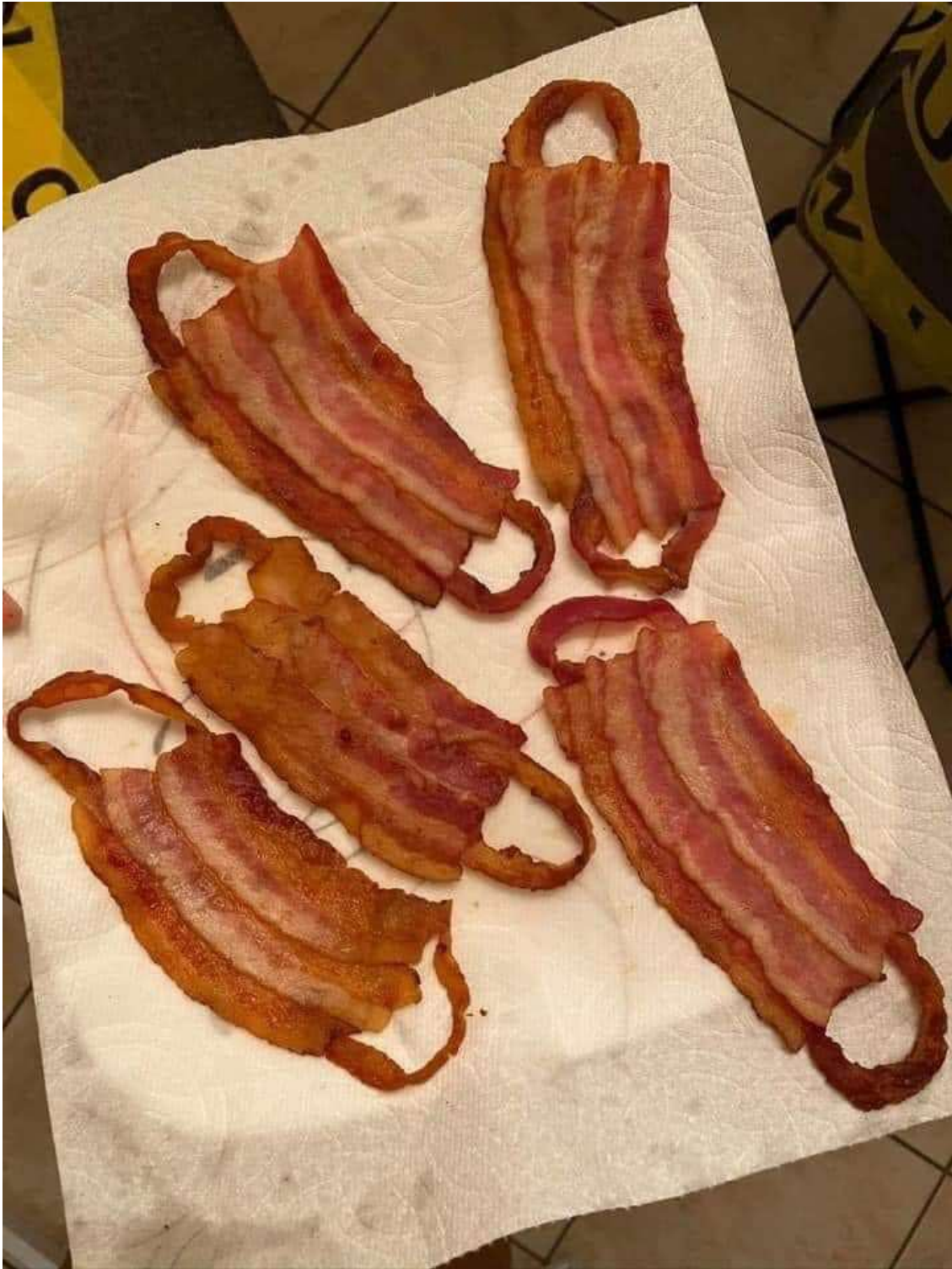
COVID-19 Masks for men!