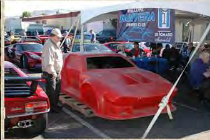
Pantera Parts Connection Morning Breakfast