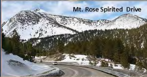
Mt. Rose Spirited Drive

The 2023 Fun Rally will feature a variety of attractions around Reno and Lake Tahoe for all attendees beginning with Scenic Drives, Car Show, Tech Sessions (ZF Transmission/Electrical). The traditional Hospitality Suite (3 drink tickets per day included) will feature vendor displays, the POCA 50/50 raffle run by Joe Russo and a Plated Banquet Dinner with guest speaker Les Gray (5 time POCA President).