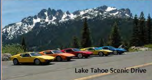
Lake Tahoe Scenic Drive