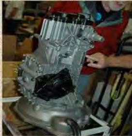
ZF Tech Session