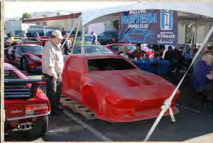
Pantera Parts Connection Morning Breakfast