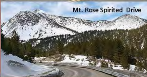
Mt. Rose Spirited Drive

The 2023 Fun Rally will feature a variety of attractions around Reno and Lake Tahoe for all attendees beginning with Scenic Drives, Car Show, Tech Sessions (ZF Transmission/Electrical). The traditional Hospitality Suite (3 drink tickets per day included) will feature vendor displays, the POCA 50/50 raffle run by Joe Russo and a Plated Banquet Dinner with guest speaker Les Gray (5 time POCA President).