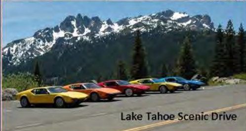
Lake Tahoe Scenic Drive