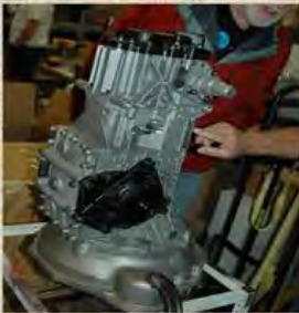
ZF Tech Session