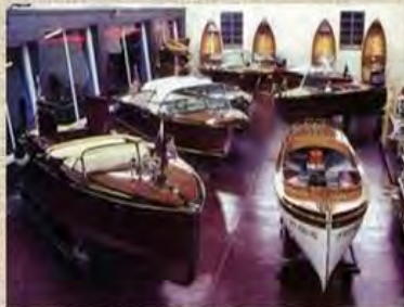
Sierra Boat Works Tour

The 2023 Fun Rally will feature a variety of attractions around Reno and Lake Tahoe for all attendees beginning with Scenic Drives, Car Show, Tech Sessions (ZF Transmission/Electrical). The traditional Hospitality Suite (3 drink tickets per day included) will feature vendor displays, the POCA 50/50 raffle run by Joe Russo and a Plated Banquet Dinner with guest speaker Les Gray (5 time POCA President).