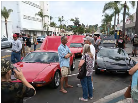
San Diego chapter hosted Pantera Night at